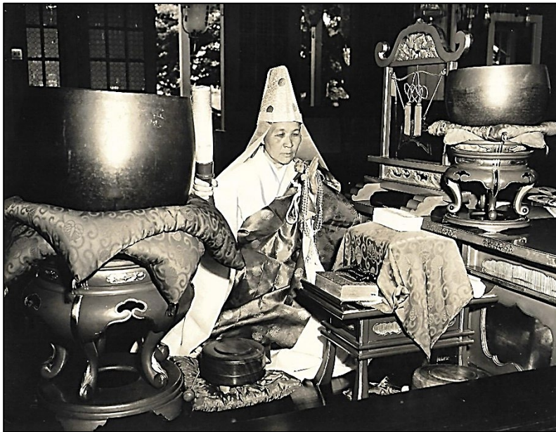
The Buddhist priestess starts her day and ends it with prayer. Kneeling at the ornate gold-leaf and red-lacquered altar, she strikes the gigantic bronze bowl which is a signal for her readiness to receive purification and truth from the presence of Divinity. She speaks no English, and her prayers are chanted in Japanese. She came to Hawaii from Japan in 1918 and took her priestess vows in 1933.