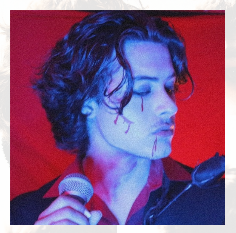
What has been your favourite single you've released so far and why?

I think it's gotta be "Body Bag" because that was the first song that really sounded exactly like the music I wanted to make from a production standpoint. That one also wrote itself. It's also my favorite song to perform live.