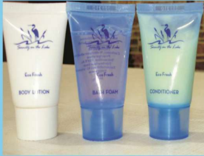
Imported toiletries in tubes 20/30 ml body lotion, body wash, conditioner, shampoo