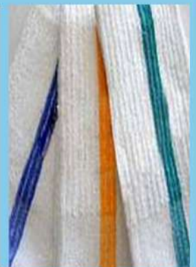
TERRY BAR MOP