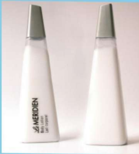
Toiletries in bottles

HOUSEKEEPING PRODUCTS AND KITS ARE ONE OF THE BEST IN THE INDUSTRY. WE IMPORT TOILETRIES FROM AND ALSO PROVIDE HERBAL PRODUCTS. THE PACKAGING IS DONE IN ACCORDANCE WITH THE CLIENT'S REQUIREMENT AND WITH THEIR BRAND LOGO, IF REQUIRED.