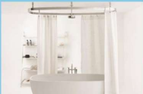
Water repellent polyester shower curtain

Closed and open toe terry/velor slippers Waffle slippers Natural jute slippers