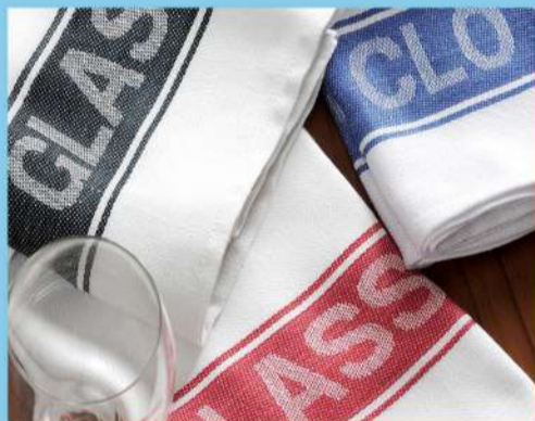
JACQUARD GLASS CLOTH