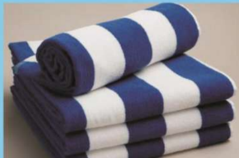
100% cotton terry cabana stripes pool towel