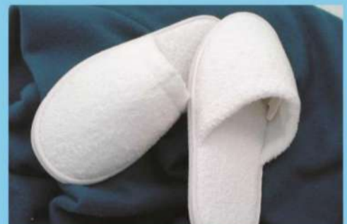
Room slippers with logo

Closed and open toe terry/velor slippers Waffle slippers Natural jute slippers