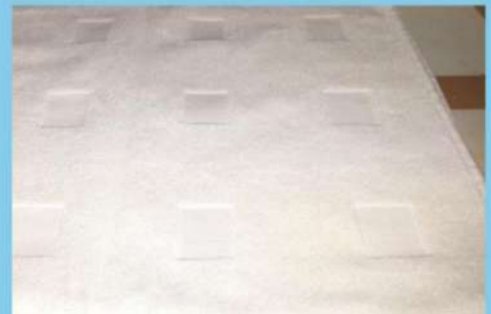
100% cotton heavy quality bathmats

Terry bathmats in 800+ gsm 20"x32", 360 grams/pc