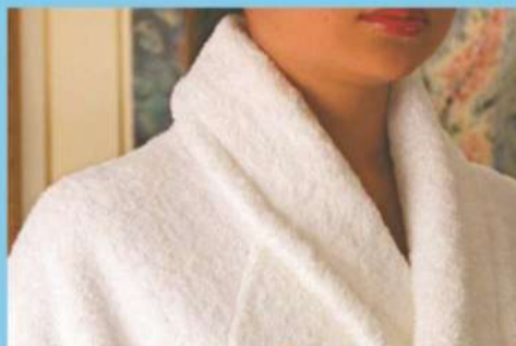
100% cotton luxury bathrobes

Terry bathrobes Waffle bathrobes Velor bathrobes