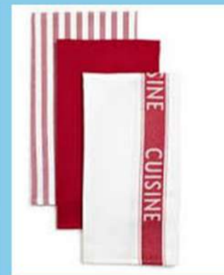
YARN DYED KITCHEN TOWEL