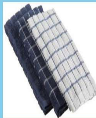
TERRY KITCHEN TOWELS