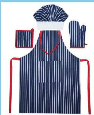
APRON , CAP MITT, HOLDER