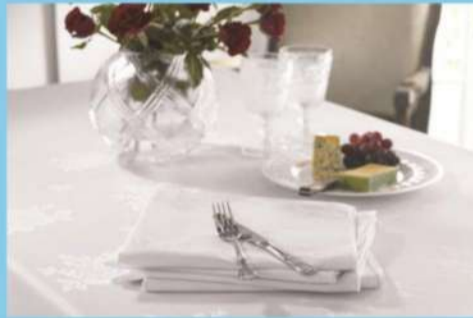
Rose damask table linen

Table covers and napkins as per custom size