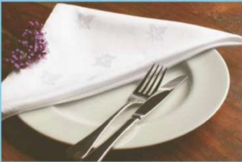
Jacquard damask Ivy leaves napkins

Sizes: 18"x18", 22"x22", 35"x35", 54"x54", 54"x70"