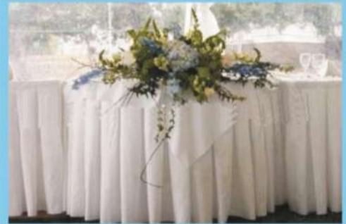
Satin table skirting

Table covers and napkins as per custom size