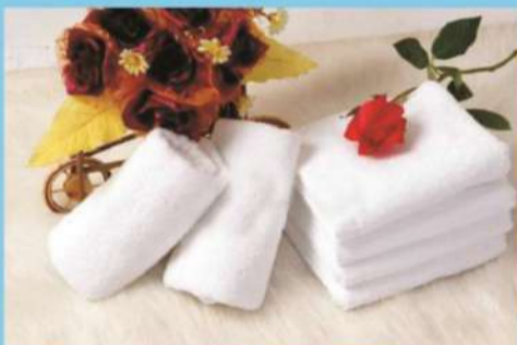
100% cotton terry towels in 550 gsm

Bath towels: 30"x60", 630 grams/pc Hand towel: 16"x24", 150 grams/pc Face napkins: 12"x12", 50 grams/pc