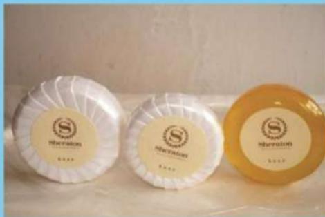
Hand wash soap and clear bath soap 10/20/30/35 grams