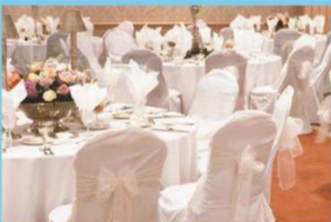
Lycra chair cover