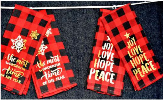
339-20 , 340-20 , 341-20, 342-20