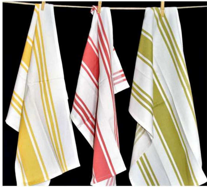
305-20 , 306-20 , 307-20,