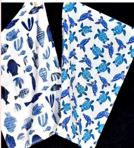
348-20 , 349-20