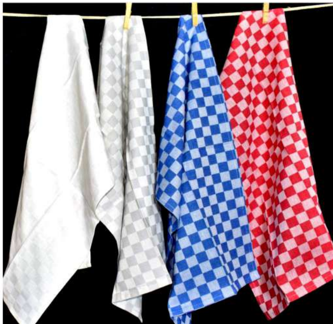
329-20 , 330-20 , 331-20, 332-20