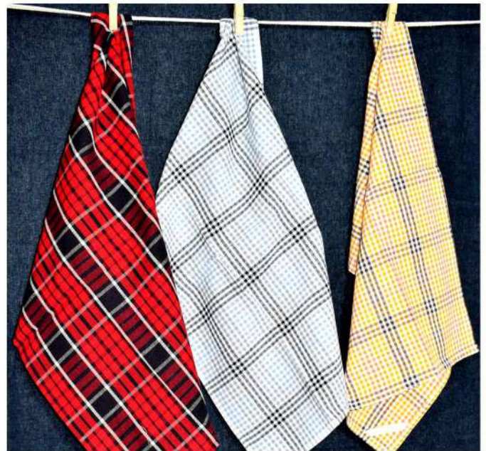
308-20 , 309-20 , 310-20,