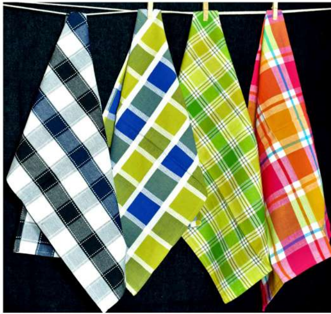
301-20 , 302-20 , 303-20, 304-20