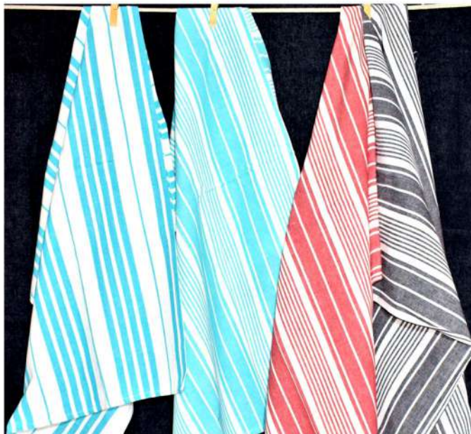
311-20 , 312-20 , 313-20,