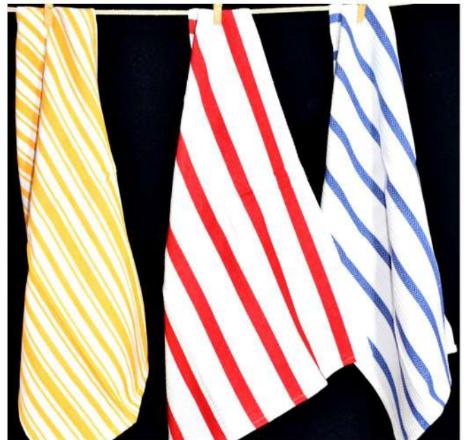
326-20 , 327-20 , 328-20,