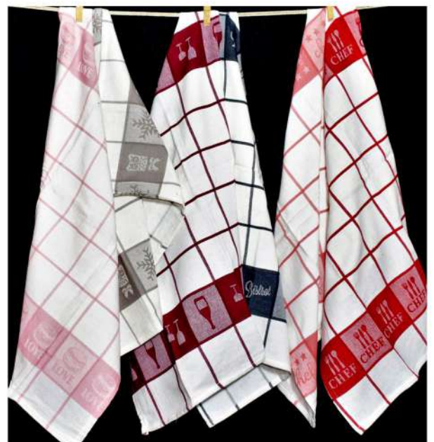
314-20 , 315-20 , 316-20,