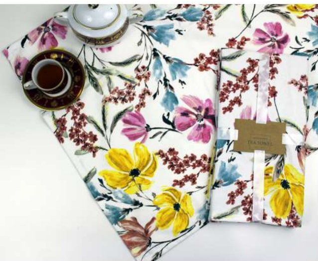
Tea Towel & Place Mat