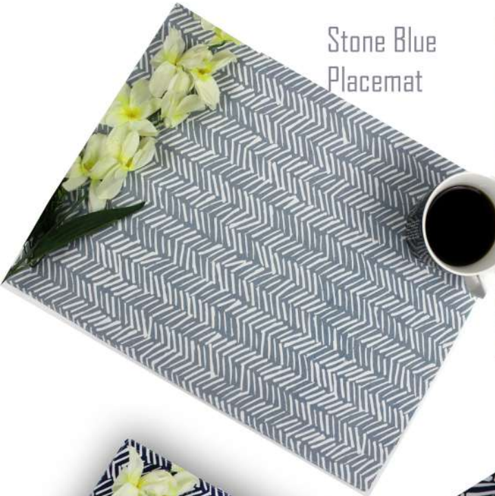
Stone Blue Placemat