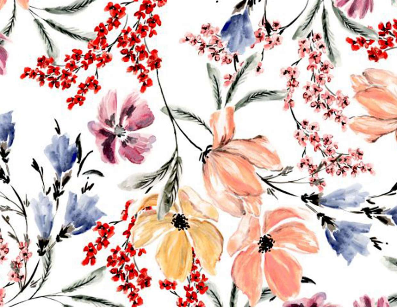
Design : Spring Floral