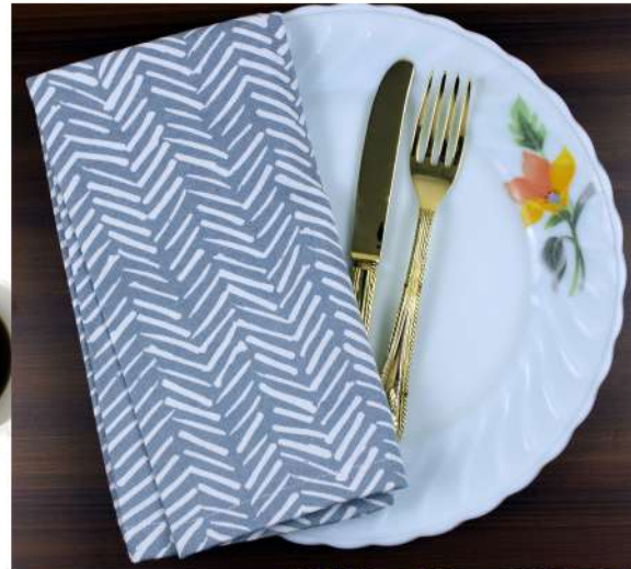
Stone Blue Napkin