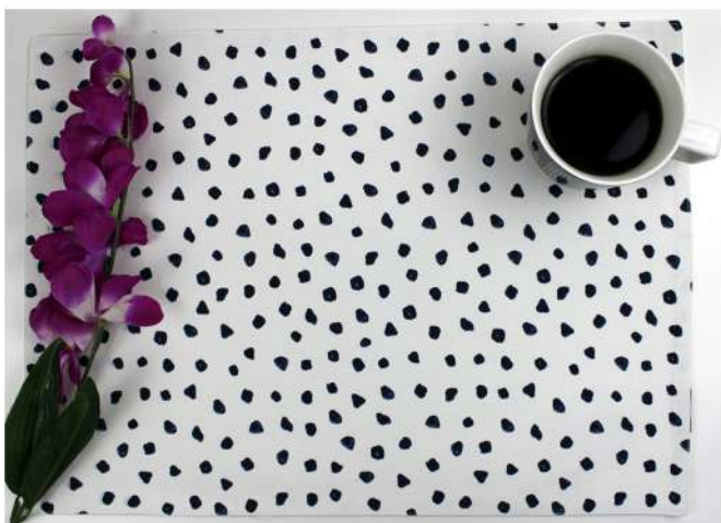
Design : Lola