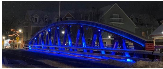
Fairport Bridge is currently lit up in Ukrainian flag colors