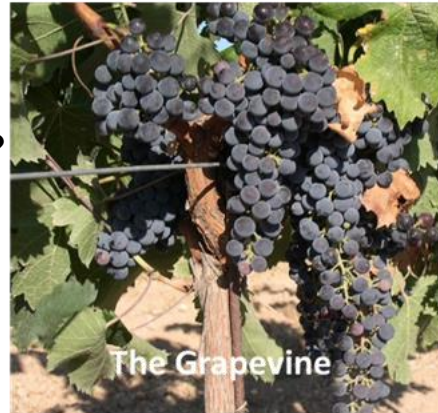
The District Newsletter

https://clubrunner.blob.core.windows.net/00000050098/en-ca/files/homepage/district-7120-newsletter-2022-may-grapevine-i/District-7120-Newsletter-2022-May-Grapevine-Issue.pdf