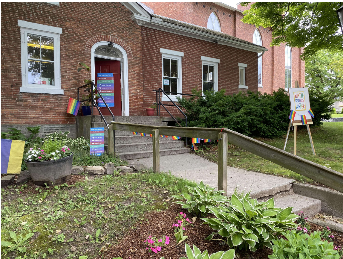
St. Paul's welcomed the Pride Marchers.