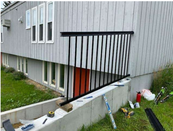
First section of wall railing installed.