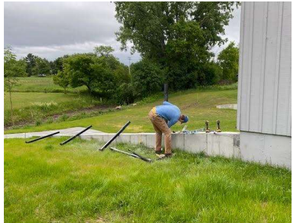
Laying out the wall railing posts