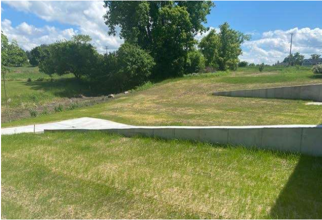
Wall with no railing

Between June 9 th and 14 th , Craig Wielenga installed railings on top of the two back-lawn retaining walls, and along the new sidewalks.