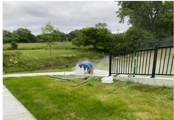
Prepping for the last section of wall railing