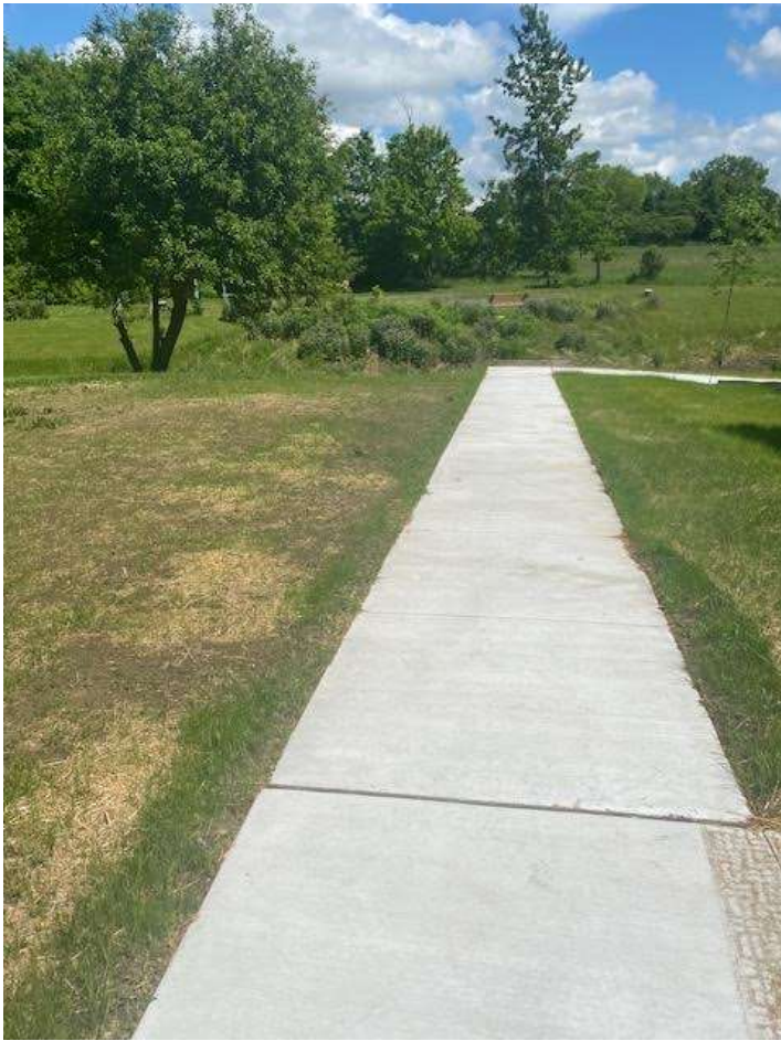
Before the sidewalk railing