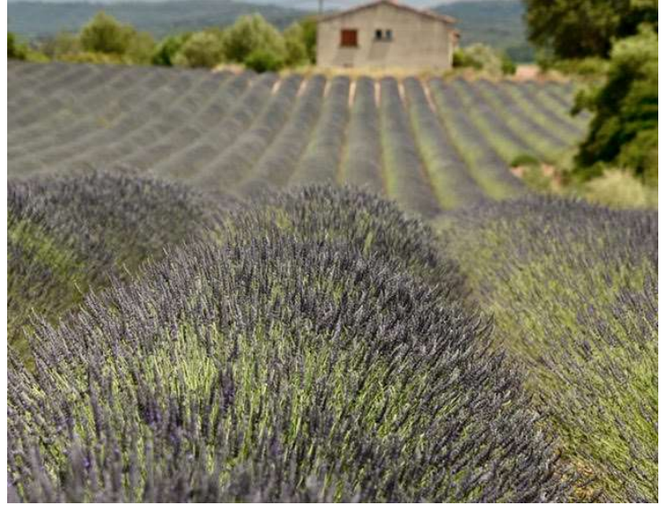
Sarah's Pictures from France