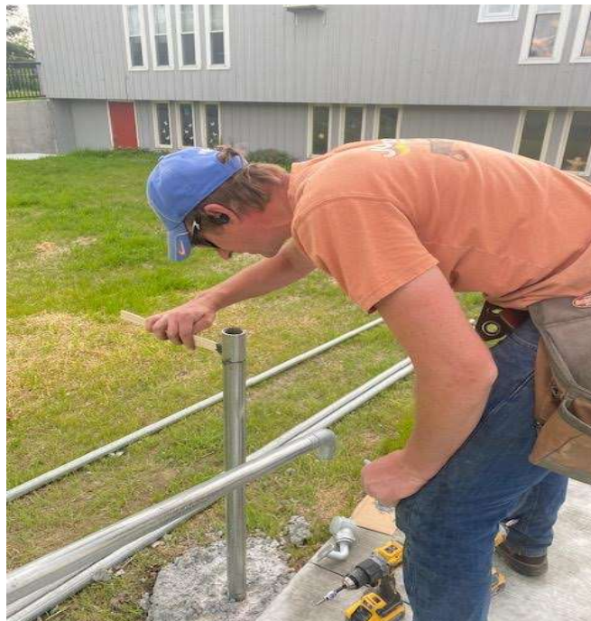
Detail work on the ADA sidewalk railing.