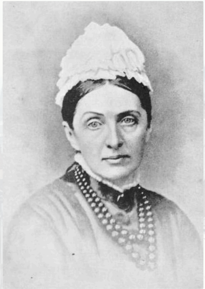
Isabella Bird

Because I only just grazed the surface of Isabella's adventures in my novels, I encourage you to learn more about her and even read her firsthand travel accounts. After all, as Isabella has said herself in A Lady's Life in the Rocky Mountains , "Everything suggests a beyond."