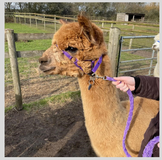
† This is Floyd

In February, my sister and I spent a morning walking Alpacas - we had the pleasure of meeting a beautiful alpaca called Floyd. It really was a lovely morning, learning more about these wonderful animals and having a chance to walk them and stroke their unbelievably soft coat.