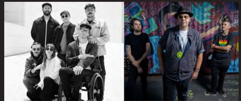
Alaskan-bred rock bands Portugal. The Man (left) and Blackbird.