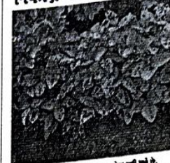
લેનના પાકમાં પેટ્રોલના પાકમાં છુવાત નિયંત્રણ અંગે માહિતી અપાઈ