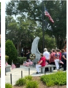
Memorial Day weekend 2024. Top pictures left to right: Chapter 925 Color Guard participated in the 2024 Military Appreciation Day Parade Market Common. The girl in the center of the color Guard was the Grand Marshall Caitlin Basset, US Army Veteran and actress on the TV SHOW Quantum Leap she is also the first female combat veteran in Hollywood. Chapter 925 Color Guard prior to the start of the parade. Bottom pictures: Chapter 925 Marching in the Military Appreciation Day Parade, Chapter 925 folding the American Flag and reading the names of fallen veterans at Vietnam Memorial in Conway.