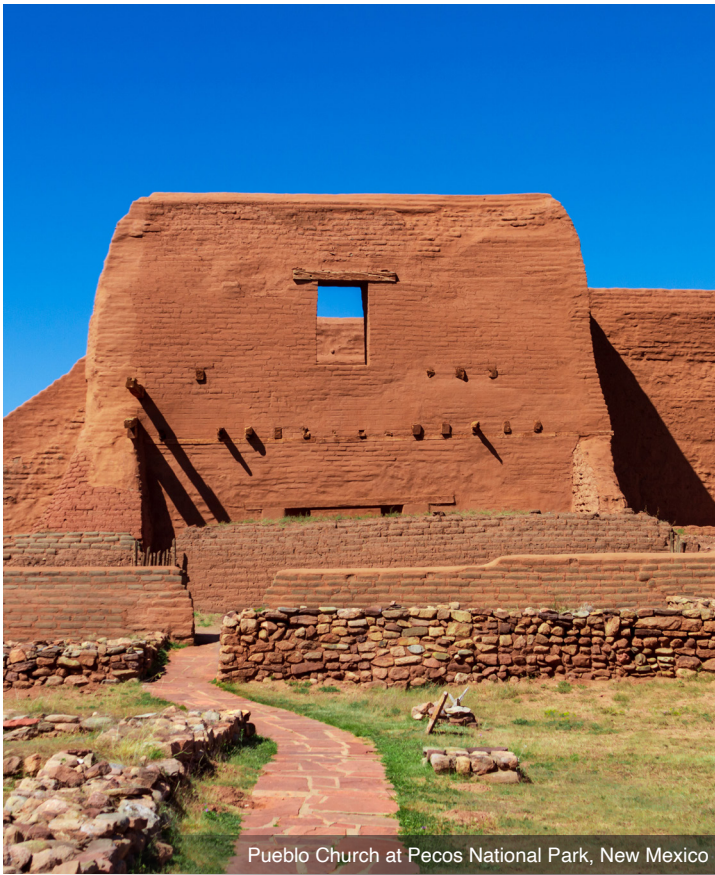
Pueblo Church at Pecos National Park, New Mexico

DAY 5 Pecos National Historic Park: Travel east of Santa Fe to visit Pecos National Historic Park, which features the ruins of Pecos Pueblo and Mission. Pecos encompasses thousands of acres of landscape infused with historical elements from prehistoric archaeological ruins to 19th-century ranches. Tonight, enjoy dinner hosted by your Tour Manager. Meals: B, D