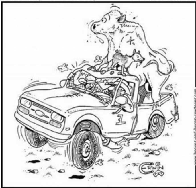
"It was cute when he was a calf,.... But it's not safe for a 1,200 pound Bull to respond to dog commands!"