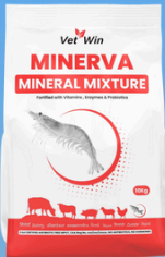
MINERVA-P A SPECIAL MINERAL SUPPLEMENT FOR AQUACULTURE PONDS Presentation: 10kg