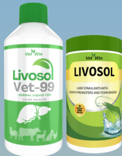
Livosol HERBAL SUPPLEMENT FOR LIVER & HEPATOPANCREAS IN FISH & SHRIMP Presentation: 5lt, 20lt, 5kg