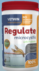
REGULATE Probiotic strains to treat Microcystis and harmful algal blooms in pond water Presentation: 1kg