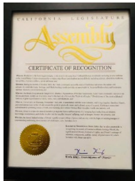
Actual Certificate of Recognition Given to Sewa Intl Representatives, Nov 7, 2021