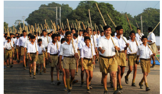
Volunteers of the Rashtriya Swayamsevak Sangh (RSS) march through a street during a three-day workers camp on the outskirts of Ahmadabad.

World's largest volunteer paramilitary organization. Founded in 1925 by Keshav Baliram Hedgewar. Inspired by the teachings of Vinayak Damodar Savarkar. Both praised Naziism and Italian Fascism, and co-opted various Hindu beliefs to promote a radical form of Hindu Nationalism called Hindutva. Their second Sarsanghchalak ("Chief" or "Head-ruler"), Madhav Sadashivrao Golwalkar, regularly praised the Nazis and said that the way they treated the Jews was a good model for how Hindus could run India. He believed that Christians, Jews, and Muslims in India should be denied rights and citizenship unless they converted to Hinduism, a belief that has been passed down to the next generation by the RSS. The RSS regularly promotes and encourages communal violence against India's non-Hindu population, especially those opposed to caste discrimination. In 2018, the CIA World Factbook recognized the RSS as a potentially dangerous "Nationalist Organization" and recognized two of its subsidiaries, Vishwa Hindu Parishad (VHP) and Bajrang Dal 3 , as "Military religious organizations." The RSS' ultimate goal is a united Hindu Nationalist South Asia, which they refer to as Akhand Bharat. They are endemically casteist, racist, and vehemently opposed to the notion of India as a pluralistic, secular state.