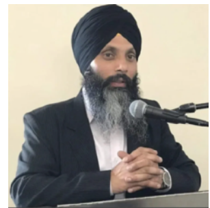
Slain Canadian Sikh Activist Hardeep Singh Nijjar.