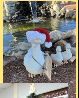
Preparing for the Holiday Spirit