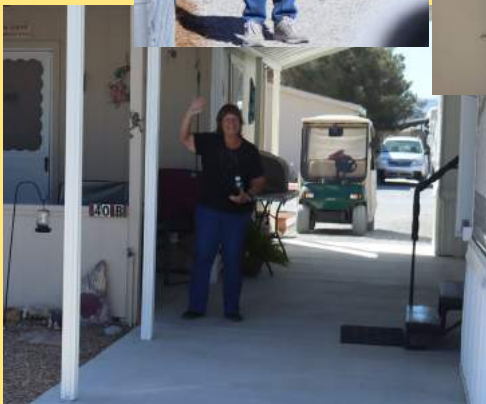
Meet your neighbors Open Houses