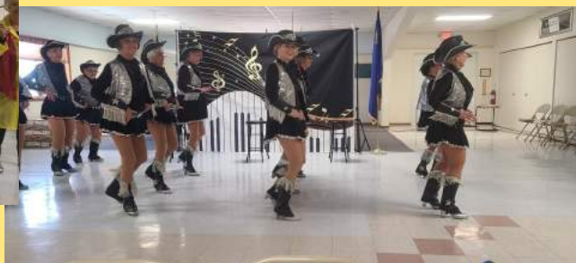
Silver Tappers Performance