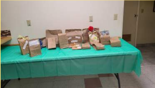
Brown Bag Auction Collection