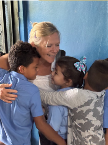
Heartwarming hugs and joyful smiles at the Ebenezer School in Honduras, where the love of Christ is shared in every embrace.