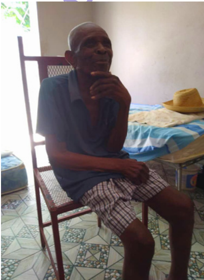
The Matthew 25 House continues to be a beacon of hope for the elderly in Montrouis, Haiti. This home provides compassionate care, nutritious meals, and a safe place for those often forgotten. Every meal served, every smile shared, and every life comforted reflects Christ's call to care for the least of these. Your support makes it possible to meet these tangible needs with dignity and love. Let's continue to be the hands and feet of Jesus.