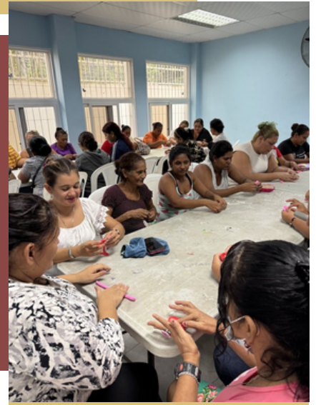
It was a beautiful moment of fellowship and sharing as women gather and connect in San Pedro Sula, Honduras, sharing joy, encouragement, and the love of Christ.