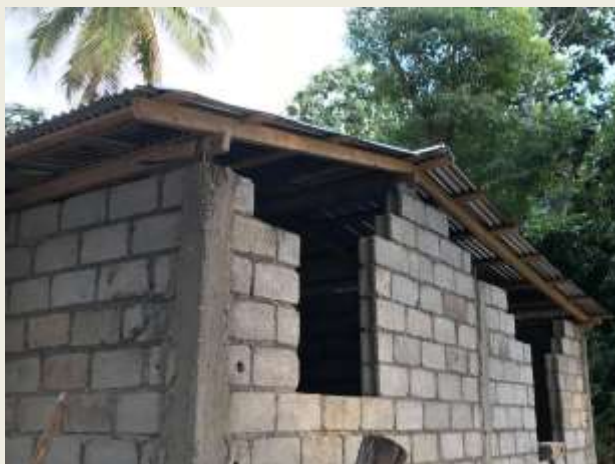
A roof to help the family complete the home build.