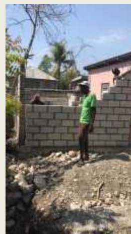
Walls are going up!