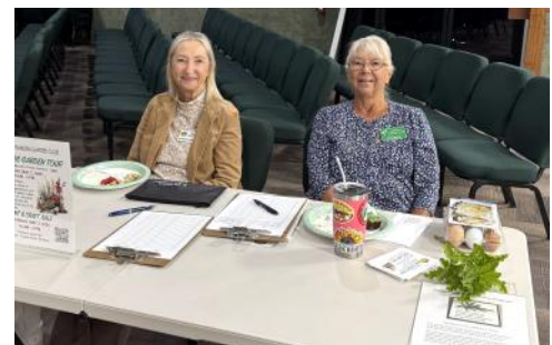
Tickets for the Garden Tour!! Get yours soon!