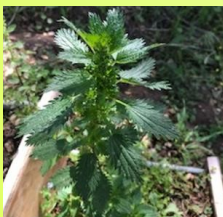
Stinging Nettle— Good for heart, kidney & gallbladder health, treats respiratory conditions, good for blood circulations,