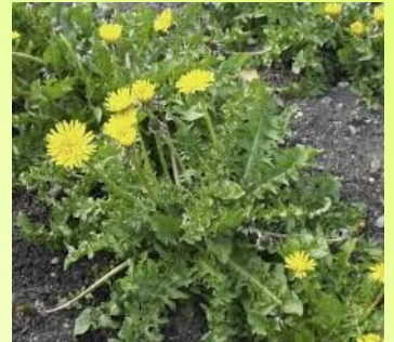
Dandelion— Full of Antioxidants, boosts immune system, supports healthy digestion, kills cancer cells.

{Other examples of edible "weeds" are stinging nettle which can be made into a delicious and nutritious tea. Put in a pot, cover with water and simmer for 20 minutes. Add tsp honey and squeeze of lemon and enjoy. To me it tastes like vegetables. A third example is " Miner's Lettuce ," which I have heard makes a delicious salad. Check to see if you have any of these in your yard. Fortunately for me, I have all 3 growing like wildfire all over the place...I'LL NEVER BE HUNGRY AGAIN!}