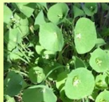
Miner's Lettuce— Purify blood, improve heart function, reduce cholesterol. Rich in Vitamin C, can be taken as an invigorating spring tonic.