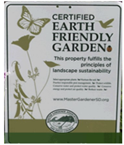
The Ramona Garden Club meets at 12:15 p.m. on the 2nd Wednesday of each month at Mountain View Community Church, 1191 Meadowlark Way