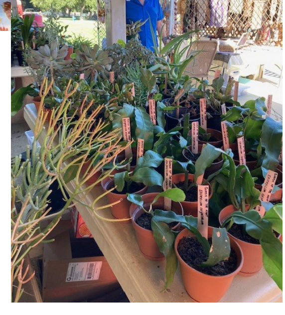
Plant and Craft Sale October 2023