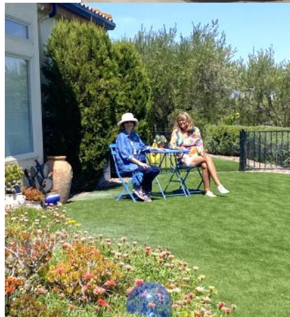
Pre Tour for all the Volunteers