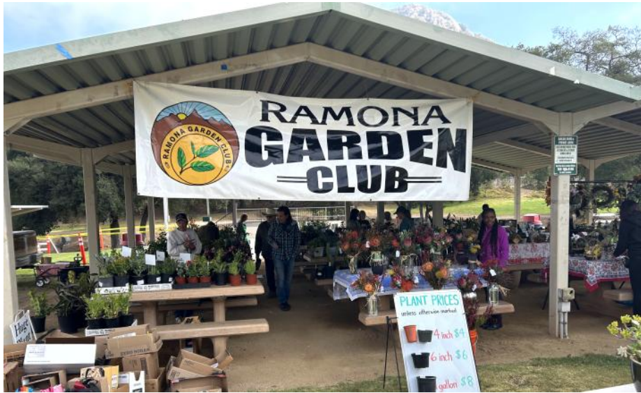
A few pictures from the Plant/Craft Sale