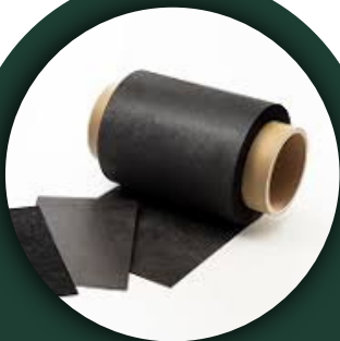
Gas Diffusion Layers