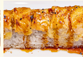
BAKED SALMON ROLL 12.50

california roll with fresh water eel, eel sauce