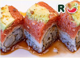
MEXICAN FIESTA ROLL 15.50

shrimp tempura roll topped with salmon, crab mix, avocado, spicy mayo