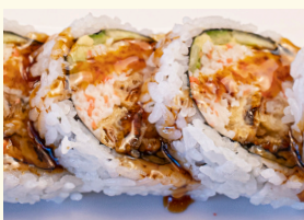
SOFT SHELL CRAB ROLL 13.50 5 pcs

cucumber, avocado, crab, yamagobo, kaiware, eel sauce