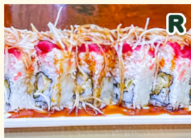
DELUXE SHRIMP TEMPURA ROLL 15.50 8 pcs *Half Roll Available

Soft shell crab, cucumber, avocado, yamagobo, crabstick