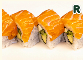
PHILADELPHIA ROLL 13.50

cucumber, avocado, cream cheese and salmon