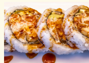
SHRIMP TEMPURA ROLL 10.50 8 pcs