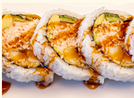
CALAMARI TEMPURA ROLL 9.50 8 pcs

Shrimp tempura, topped with crab mix, tuna, and daikon