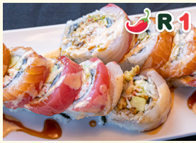
NAMBA ROLL 19.50 10 pcs

soft shell crab roll, tuna, salmon, white fish, eel sauce, spicy mayo