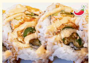
GREEN CHILI TEMPURA ROLL 10.50 5 pcs

cucumber, avocado, vegetable tempura, eel sauce