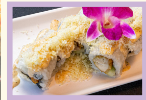
BTS ROLL 12.50

shrimp tempura, cream cheese, avocado, topped with crab and white tuna, dynamite sauce, eel sauce, hot sauce