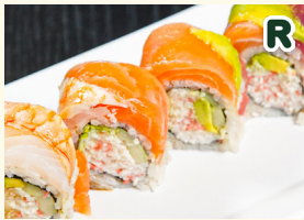
RAINBOW ROLL 14.50