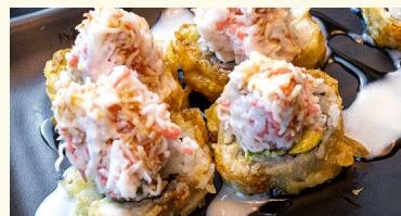
CRAZY RICH ROLL 10.50

deep fried spicy tuna and crab, spicy mayo and eel sauce