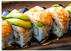
SHRIMP KILLER ROLL 13.50

soft shell crab roll, tuna, salmon, white fish, eel sauce, spicy mayo