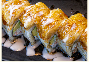
BANANA ROLL 10.50

shrimp tempura roll topped with spicy tuna, jalapeno, avocado, spicy mayo