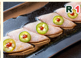
YELLOWTAIL JALAPENO 6 pcs