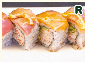
LEMON ROLL 15.50

california roll with spicy tuna, white fish, jalapeno, spicy ponzu, hot sauce