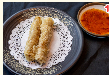
SHRIMP NET SPRING ROLL 2 pcs