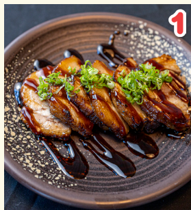
GRILLED PORK BELLY 6 pcs