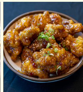
KOREAN FRIED CHICKEN