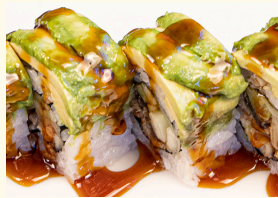
CATERPILLAR ROLL 14.50

crab, avocado, topped with white fish, dynamite sauce and eel sauce