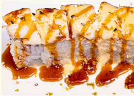
SNOW CORN ROLL 14.50

crab, avocado, topped with white fish, dynamite sauce and eel sauce