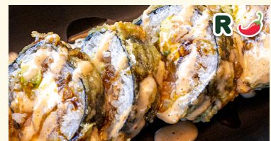
SOMETHING WRONG ROLL 12.50

deep fried avocado, crab and cream cheese roll, crab mix, yumyum sauce and eel sauce