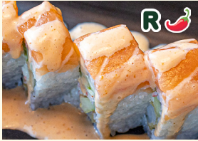
ALIANTE ROLL 16.50

shrimp tempura roll with spicy tuna, eel sauce