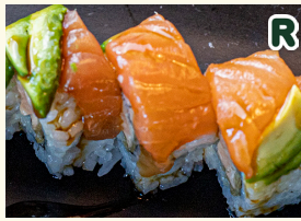
SALMON KILLER ROLL 13.50

shrimp tempura, cucumber, shrimp, avocado and eel sauce