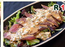
SCREAM O SALAD

pepper seared tuna, mixed greens, screaming o dressing