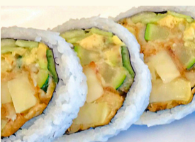
VEGGIE TEMPURA ROLL 10.50 5 pcs

cucumber, avocado, crab, yamagobo, kaiware, eel sauce