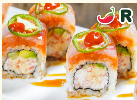
KISS OF FIRE ROLL 15.50

spicy tuna roll with salmon, avocado, green onion, spicy ponzu