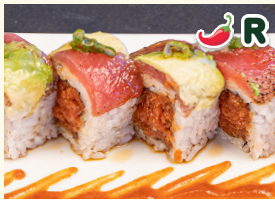
SPICY TATAKI ROLL 15.50

cucumber, avocado, cream cheese and salmon