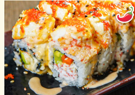
SILVER STATE ROLL 17.50

crab and avocado roll with cream cheese and tempura crunch, eel sauce