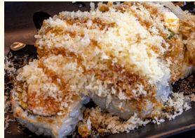
JAPANESE LASAGNA ROLL 10.50

5 pcs grilled chicken, crab, avocado, cucumber, eel sauce