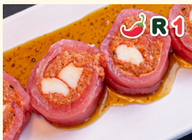
ROSE ROLL 15.50

tuna, salmon, white fish, crab, radish, radish sprout with cucumber wrap, ponzu sauce