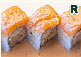
ORANGE BLOSSOM ROLL 16.50

california roll with fried banana, yuyup sauce, eel sauce