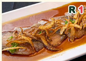
PEPPER SEARED ALBACORE 6 pcs