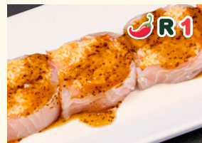
WHITE ROLL 15.50

spicy tuna, crab, wrapped with fresh tuna, spicy ponzu