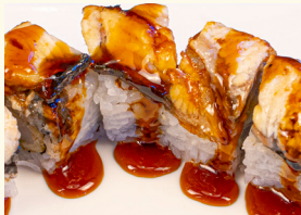
RATTLE SNAKE ROLL 16.50

korean fried chicken, dynamite sauce, cucumber, crunch, bora sauce