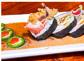
CHALINO ROLL 13.50 6 pcs *No Half Roll

Soft shell crab, cucumber, avocado, yamagobo, crabstick