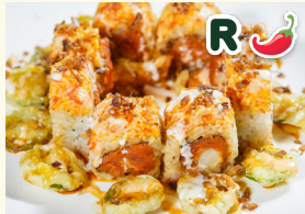
MONSTER ROLL 16.50

deep fried shrimp, crab topped with salmon / tangy sauce