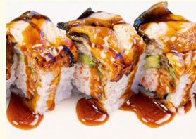
DRAGON ROLL 13.50

fresh water eel, cucumber, topped with sliced avocado and eel sauce