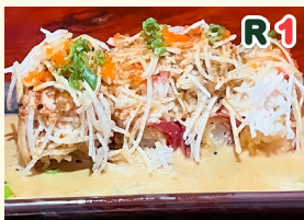
RED VOLCANO ROLL 15.50 *No Half Roll

Shrimp tempura wrapped in Tuna topped with crab mix, daikon, green onion and masago