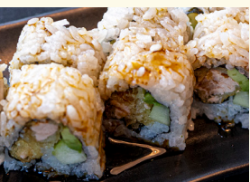
SALMON TEMPURA ROLL 11.50 8 pcs