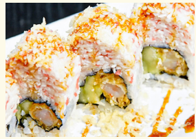
JACKPOT ROLL 13.50

salmon tempura, cucumber, salmon, avocado and eel sauce