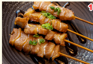
PORK BELLY SKEWER