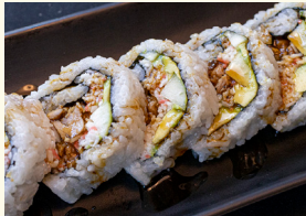
CHICKEN TERIYAKI ROLL 11.50

fried salmon, cream cheese, avocado with salmon and eel sauce