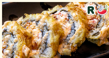
HUNGRY ROLL 10.50

deep fried spicy tuna and crab, spicy mayo and eel sauce