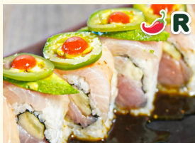
DOUBLE HAMACHI ROLL 16.50

california roll with yellowtail and salmon, sliced lemon, ponzu sauce