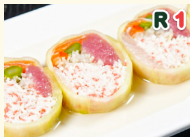
ROCK & ROLL ROLL 15.50

Shrimp tempura wrapped in Tuna topped with crab mix, daikon, green onion and masago