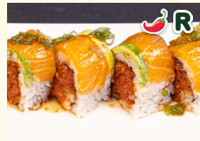
SUNRISE ROLL 14.50

spicy tuna roll with seared tuna and avocado, garlic ponzu, green onion, hot sauce