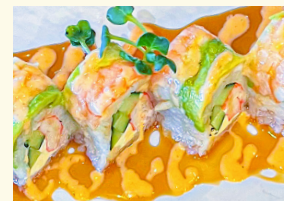
PASTEL ROLL 15.50

spicy yellowtail, cucumber, avocado, topped with jalapeno and hot sauce, spicy ponzu