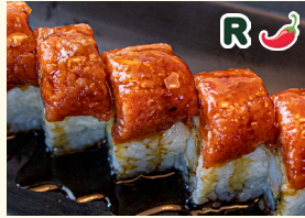
HOT NIGHT ROLL 14.50

shrimp tempura roll, crab and crunch, eel sauce