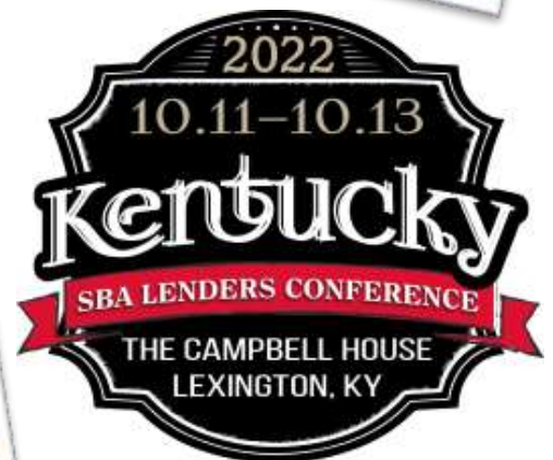
Exhibit Hall Events – Win Prizes!

Visit Exhibitors throughout the conference during breakfasts, breaks, lunch, and happy hour to earn points in our Event Game & win prizes during our closing session!