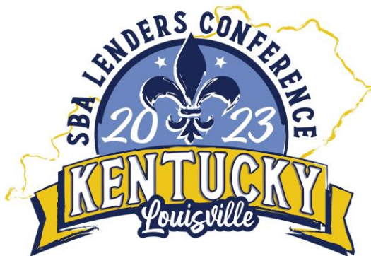
Exhibit Hall Events – Win Prizes!

Visit Exhibitors throughout the conference during the Welcome Reception, breakfasts, breaks, lunch, and happy hour to earn points in our Event Game & win prizes during our closing session!