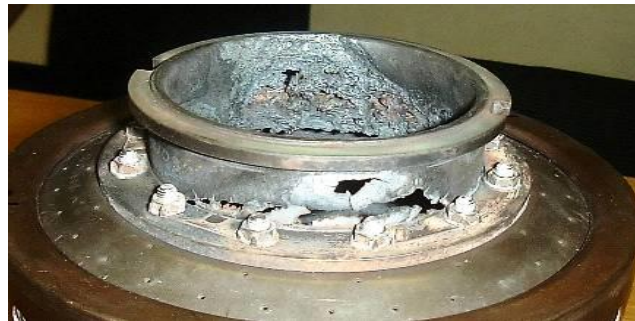
Figure 1: Combustor Pre-chamber damage as the result of hydrocarbon carry-over along with poor control of dew point

The presence of higher hydrocarbons can impact the emissions signature of a gas turbine. The longer hydrocarbon chains result in a higher flame temperature within the combustor, increasing the \text{NO}_x emissions, even when Dry Low Emissions combustors are used. In liquid form, \text{NO}_x emissions will be similar to those produced when operating on diesel fuel. \text{NO}_x formation can be by a number of ways, but thermal \text{NO}_x is by far the most dominant. Therefore, anything done to increase the combustion temperature, such as using fuels with higher hydrocarbon species will have a detrimental impact on \text{NO}_x emissions to atmosphere. It is possible to provide and apply a \text{NO}_x factor based on the assessment of a specific fuel. For example a fuel with high level of Ethane, \text{C}_2\text{H}_6 , for example 20mol%, may add as much as 10% \text{NO}_x to the total.