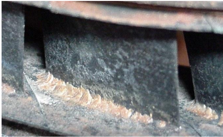
Figure 3: Silica Oxide deposits on turbine nozzle

Biogas tends to cover gaseous fuels derived from the decomposition of waste, such as in a landfill, anaerobic digester or waste water treatment. These gas fuels contain a unique contaminant in various amounts. Silica used in modern health and beauty products result in a complex range of silica based compounds being found in landfill gas and digester gas. Under the generic name Siloxanes these tend to be converted in the combustion process into silica oxide compounds which sublime in the turbine section of the gas turbine resulting in hard – glass like – deposits which impacts performance of the turbine, Figure 3 below. Treatment of the raw gas before passing to the gas turbine is the only way to prevent these deposits and today there are several proprietary methods to limit siloxane in bio-gas fuels.