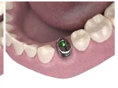
Utilize the Cervico Guide pins during the osteotomy preparations position and angulation.