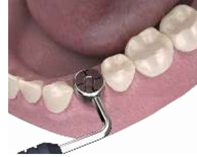
Evaluate the edentulous space dimensions with the cylindrical