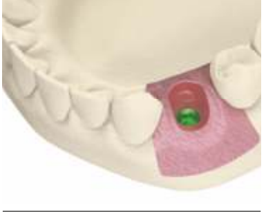
Generated emergence profile accurately transferred to the working cast