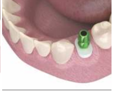
and reveal the generated natural impression post with the same orientation and following, take an implant impression.