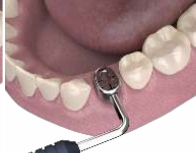
Evaluate the proper cervical profile shape and dimensions with the corresponding anatomical tab.