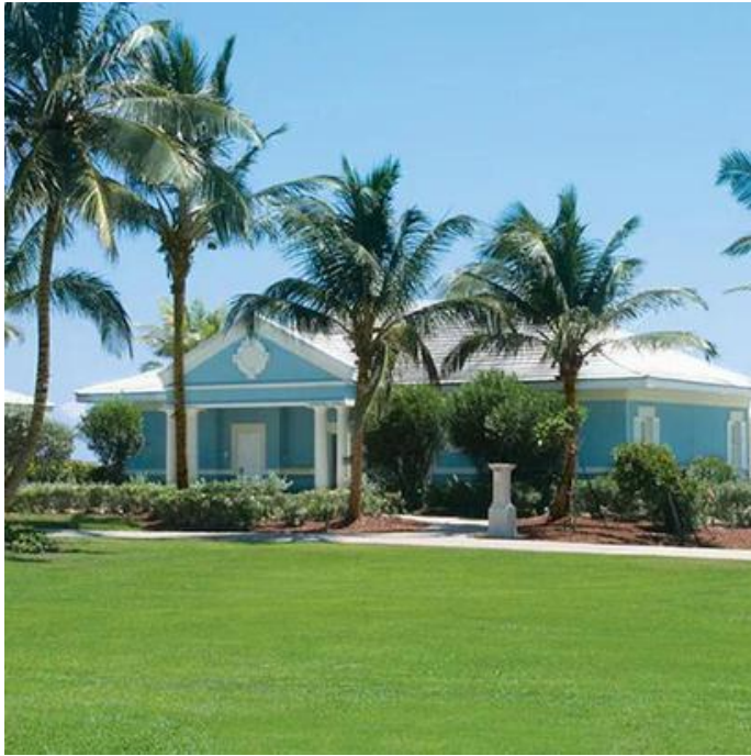
Sandals® Emerald Bay

Exquisite sophistication paired with the easy-going rhythms of the Bahamian Islands.