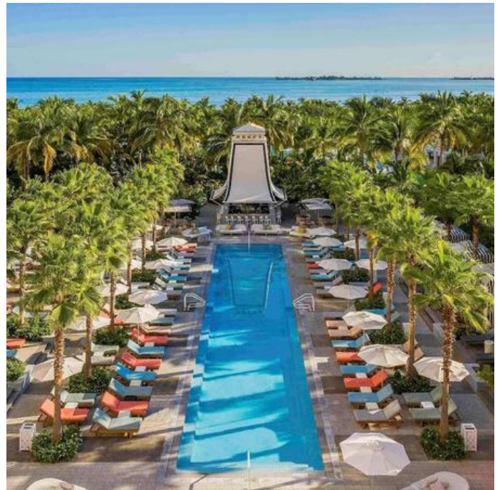
SLS Baha Mar

A balance of relaxed Bahamian refinement and astonishing natural beauty.