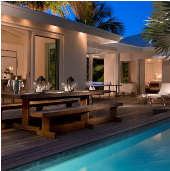
The Cove Eleuthera

A sophisticated, modern resort with its own exclusive private island for you to enjoy.