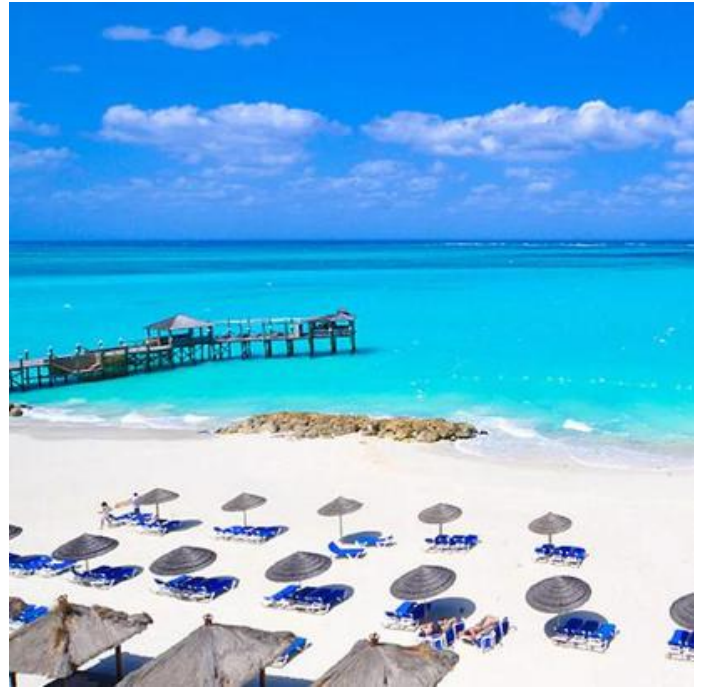
Sandals® Royal Bahamian

Exquisite sophistication paired with the easy-going rhythms of the Bahamian Islands.