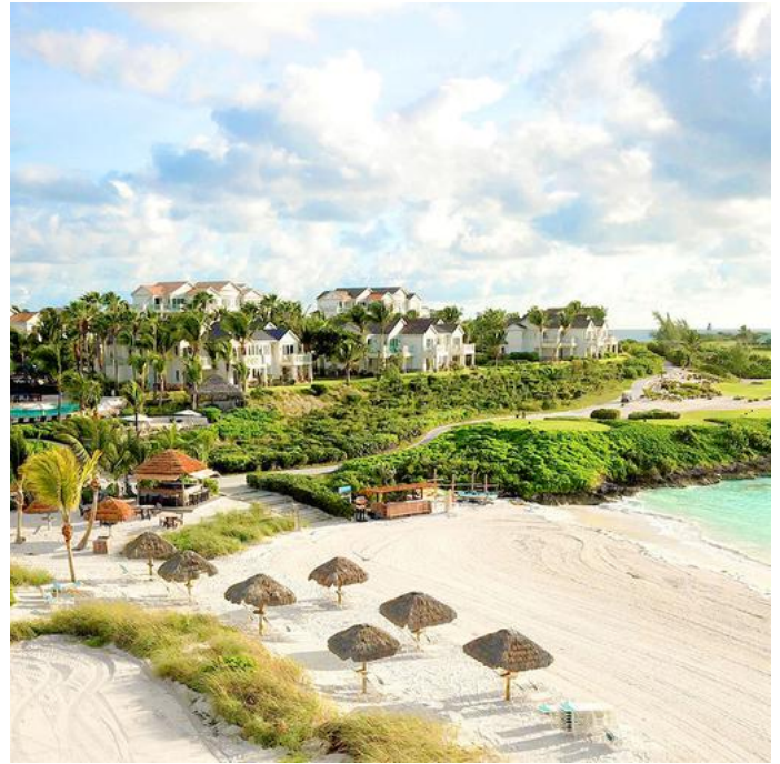
Grand Isle Resort and Residences

Surrounded by pristine waters, this private island resort has a welcoming and casual ambiance.