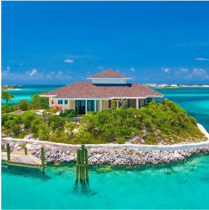
Fowl Cay Resort