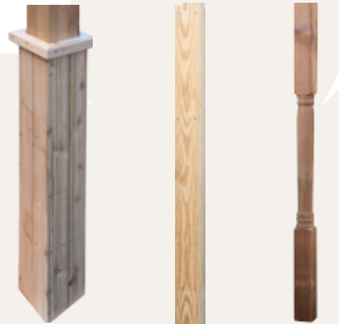
36" Decor Post Cover Cover Standard Post Turned Post