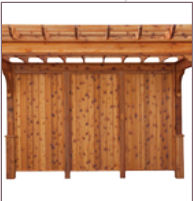
Full Privacy Wall