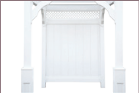
68" Privacy Wall with Lattice Top