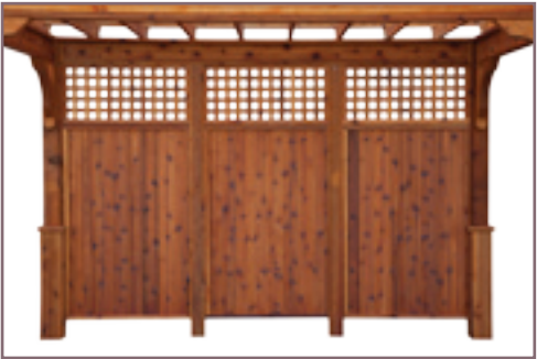
68" Privacy Wall with Lattice Top