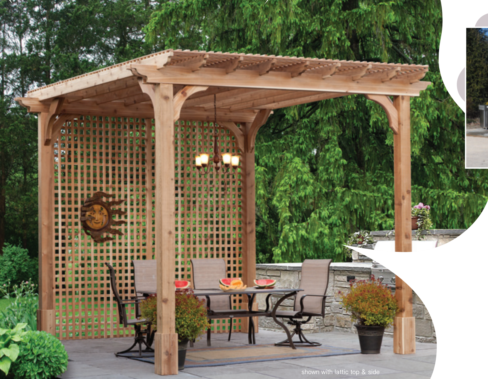
shown with lattic top & side