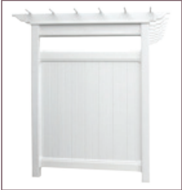
Full Privacy Wall