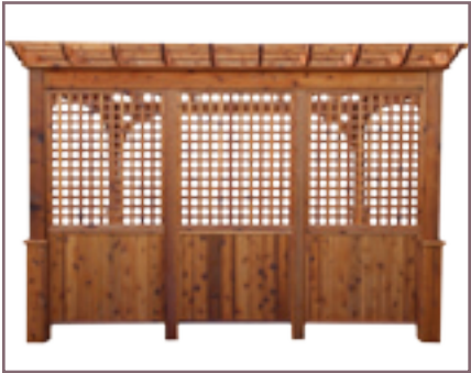
36" Privacy Wall with Lattice