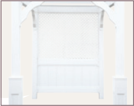
36" Privacy Wall with Lattice