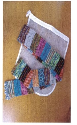
This beautifully crafted, multi-colored hand-made scarf is machine-washable and come complete with a garment-bag for your convenience.

Tickets are $1 each or six tickets for $5. Drawing at closing on Saturday, January 28, 2023. You need not be present to win. Proceeds benefit the Gilman Library. This is an easy way to make a small donation and if you win that is a bonus!