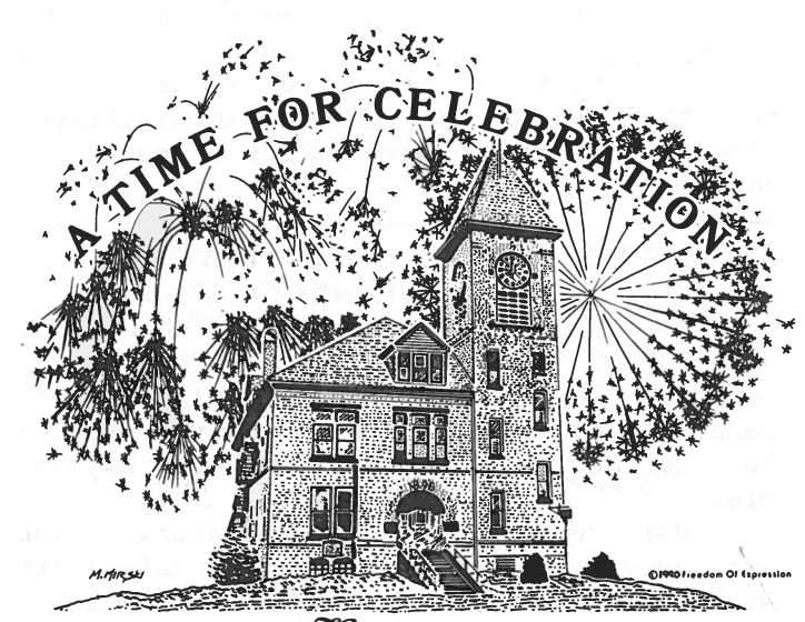
10<sup>Th</sup> Annual ALTON OLD HOME WEEK August 10–19, 1990

There are exceptions. No hazardous waste can be accepted, nor commercial construction debris on that day. In addition, there will be a limit of up to 10 tires from each household.