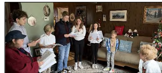
Thank you to our “Old North Carolers” for spreading Christmas spirit to our homebound!

A special thank you to our Sunday School students for doing such an amazing job telling the story of Christmas!