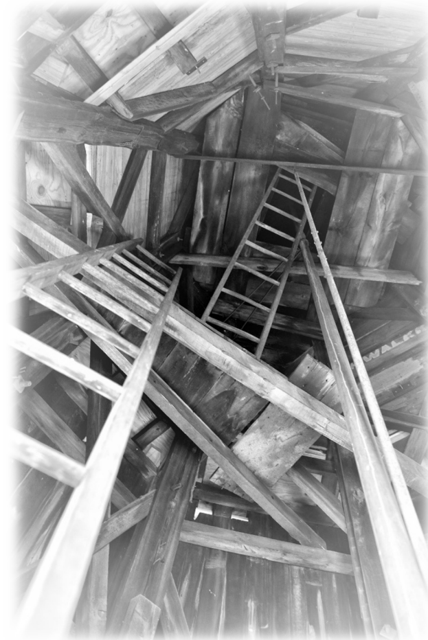
Old North Steeple