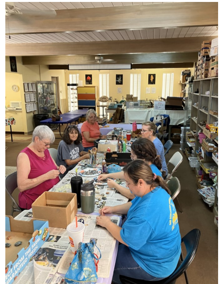
Critter parties are wild!

September 14th 8:00am - 12:00pm September 28th Critter Making Party with Pizza! Let Peggy or Fred know if you will be attending.