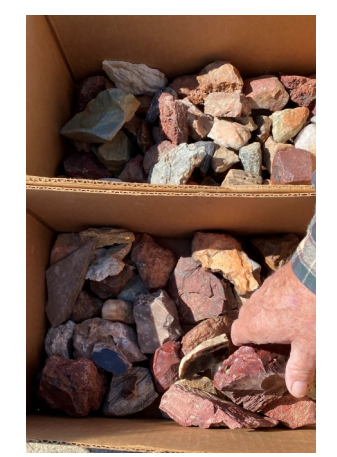
Find your favorites at the Rock Sale!