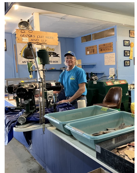
The Riverside County Fair and Date Festival is coming!