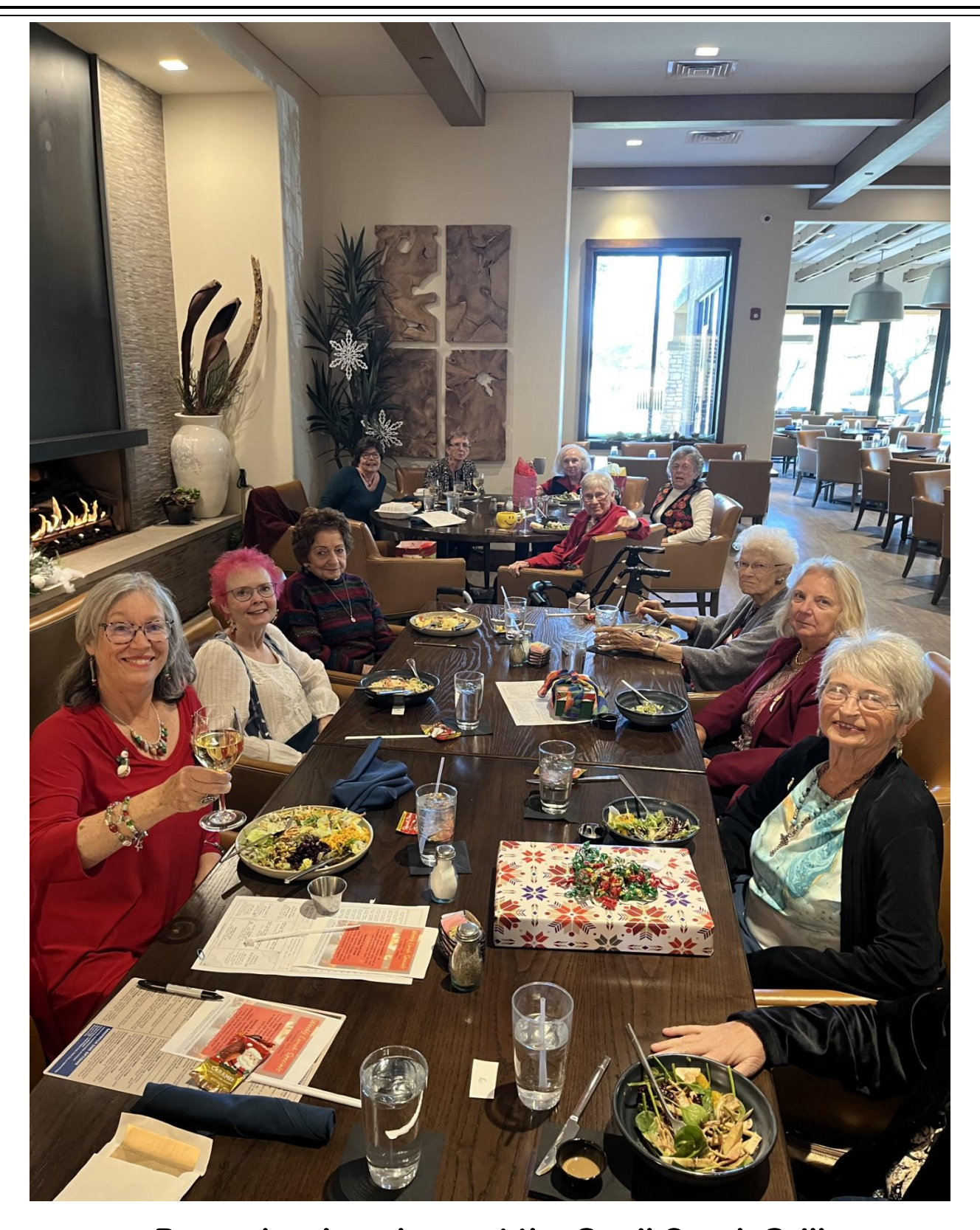
December Luncheon at the Quail Creek Grill Looks like they all had a grand ole time!!