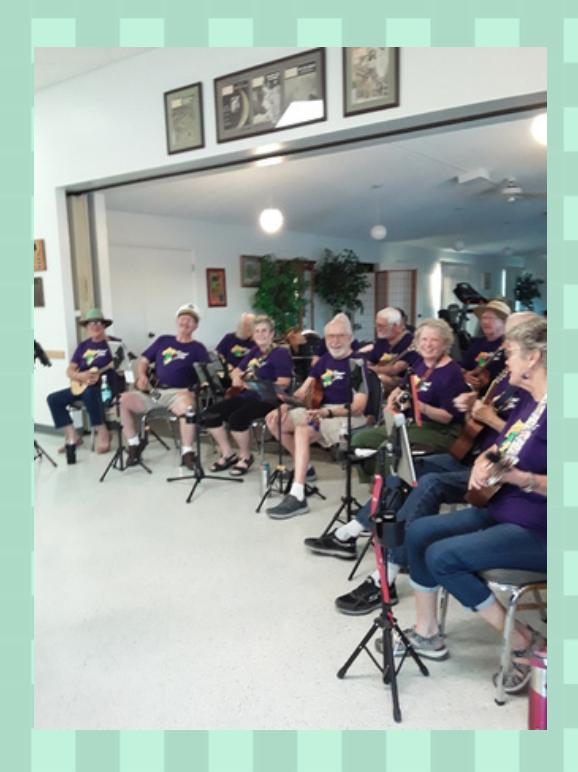
Desert Ukes entertained