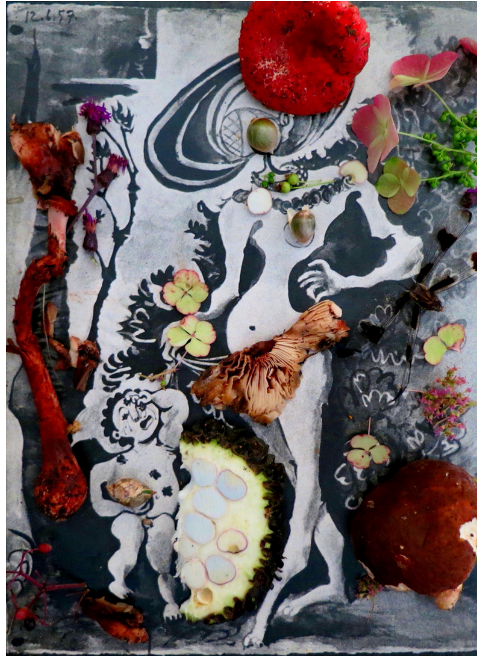
Pablo Picasso, Uncovering Jacqueline in Turkish Dress 1, 1954 Editions of 5 C-print , Image : 30 x36 in