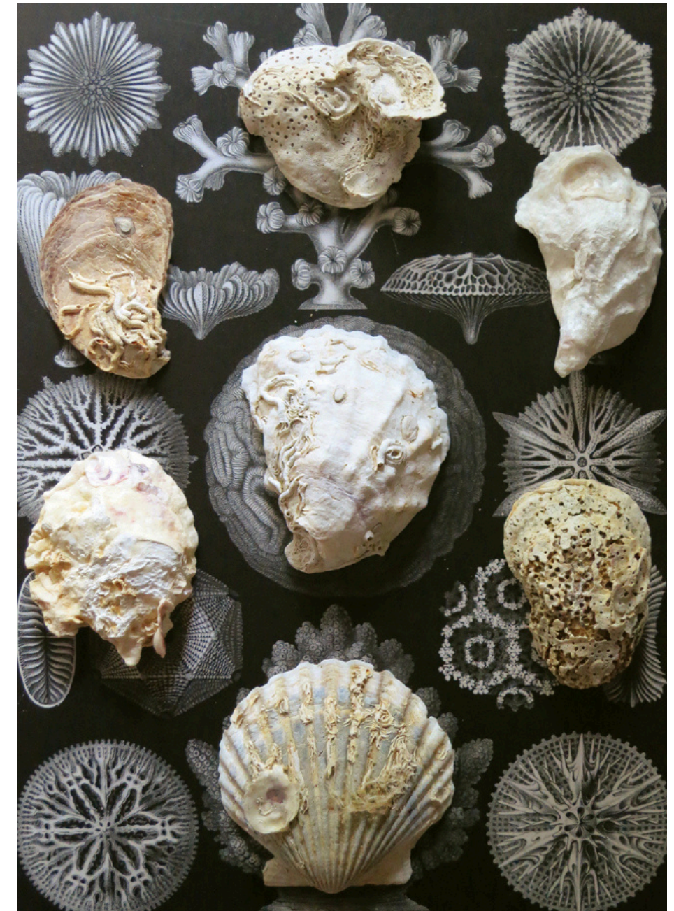
Ernst Haeckel, Uncovering Hexacoralla, 1904 Editions of 5 C-print , Image : 30 x36 in