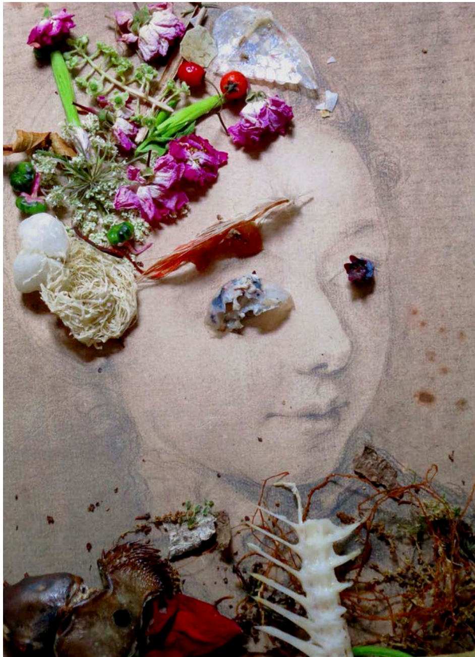
Peter Paul Rubens, Uncovering Unknown Title of Portrait, No 2, 17th Century Editions of 5 C-print, Image : 30 x 36 in