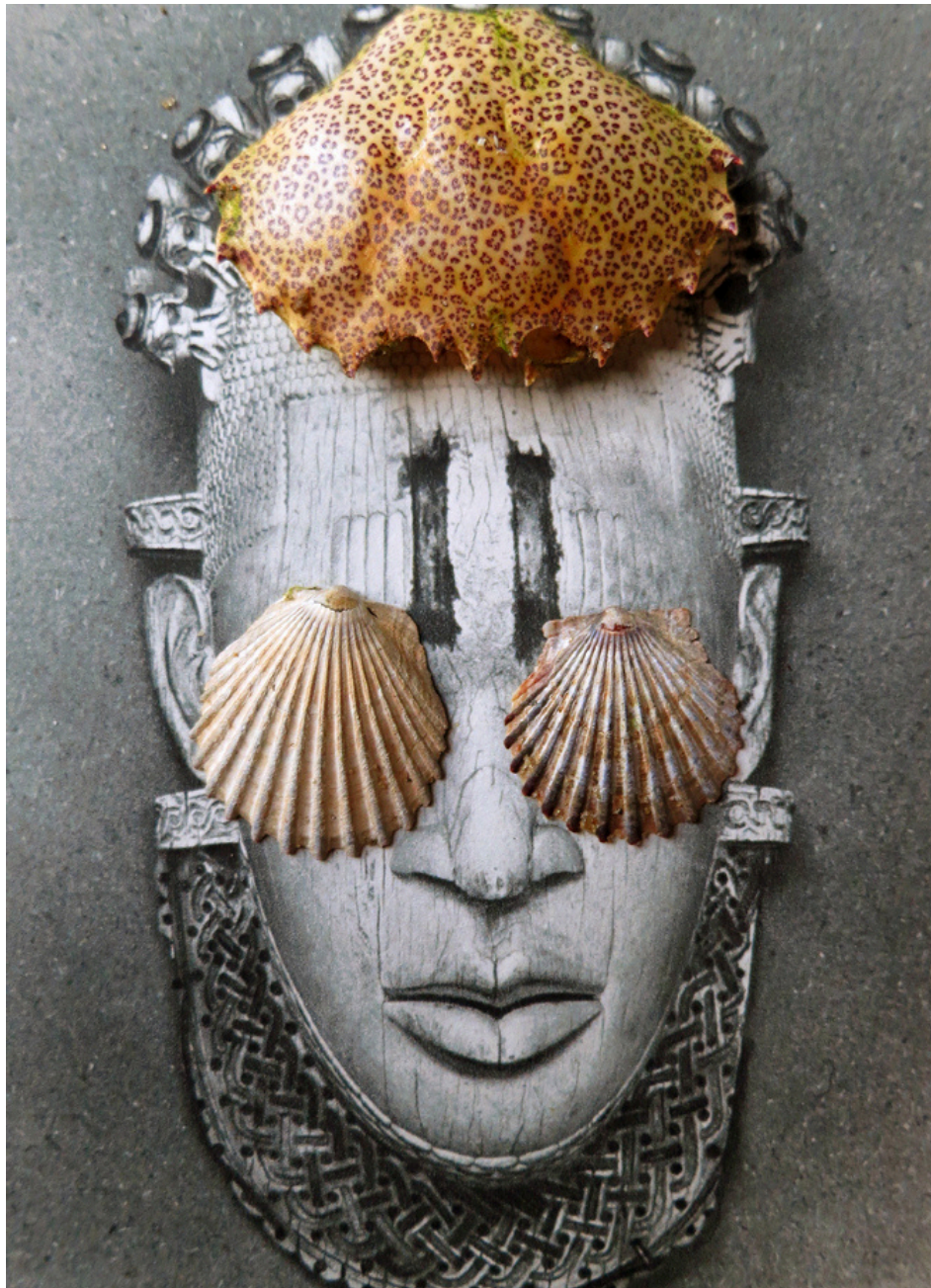
Yoruba, Uncovering Ivory Mask, 18th Century Editions of 5 C-print , Image : 30 x36 in