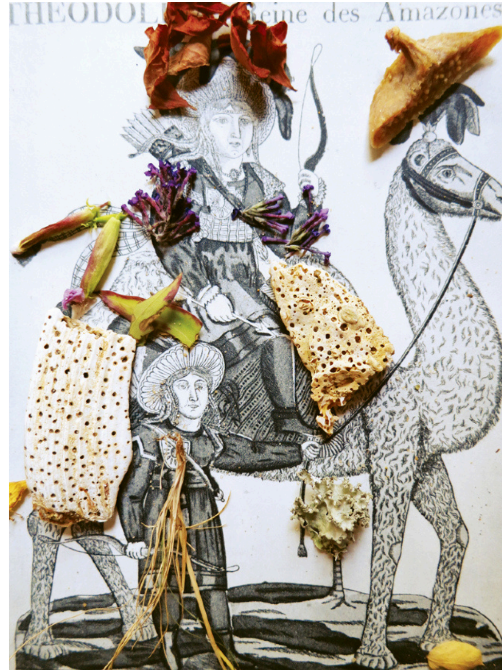
Uncovering Work of Folk Art of Lorraine, 1820 Editions of 5 C-print , Image : 30 x36 in