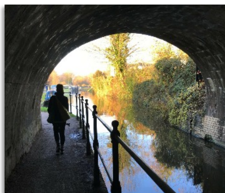
An autumn walk on the K&A Canal towpath at Darlington Wharf, Bath

B&NES will now consider all the consultation feedback to inform their final proposal, before the Council's Cabinet makes its decision on December 18.