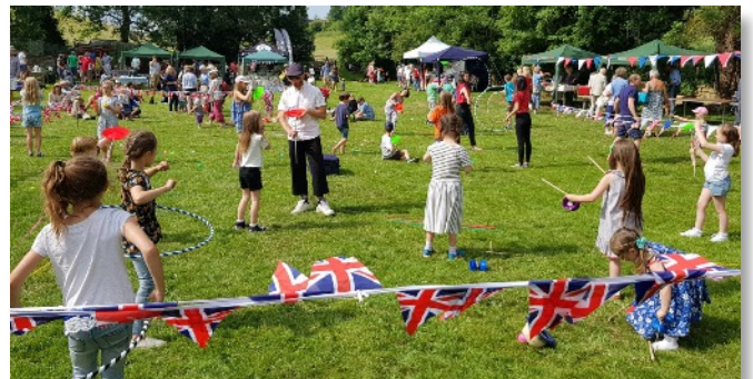
Circus skills workshop.