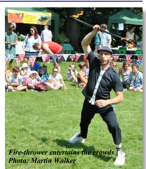
Fire-thrower entertains the crowds

Organisers would like to say a huge thank you to all their generous sponsors and to everyone who helped and supported this year's successful event.