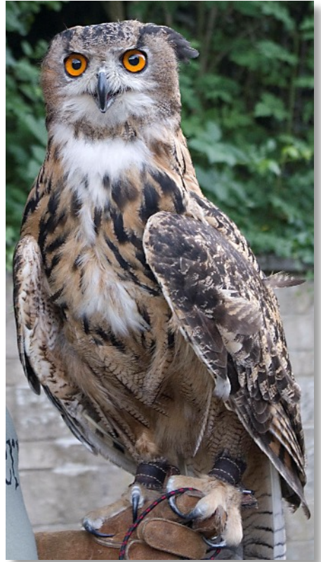
European eagle owl, Arwen, keeps a beady eye on proceedings.