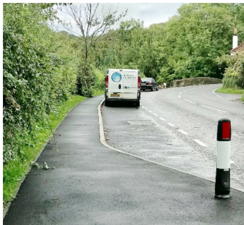
The new path behind Winsley Hill lay-by