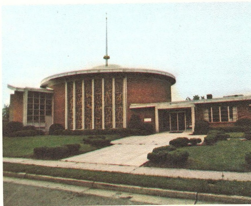
Holy Communion Lutheran Church Dedicated, Nov. 5, 1972

We are grace-filled followers of Jesus Christ who are Equipped, Encouraged, and Expected to use our Heads, our Hearts, and our Hands to go into the world.