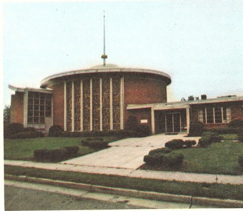
Holy Communion Lutheran Church Dedicated, Nov. 5, 1972

We are grace-filled followers of Jesus Christ who are Equipped, Encouraged, and Expected to use our Heads, our Hearts, and our Hands to go into the world.