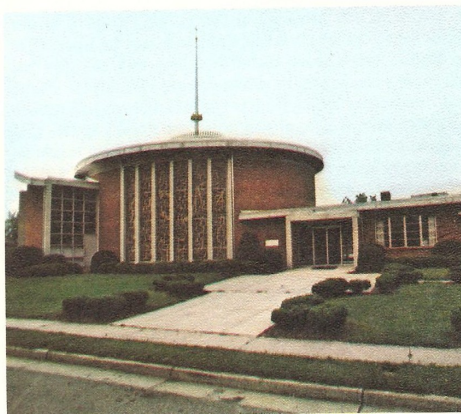
Holy Communion Lutheran Church Dedicated, Nov. 5, 1972

We are grace-filled followers of Jesus Christ who are Equipped, Encouraged, and Expected to use our Heads, our Hearts, and our Hands to go into the world.